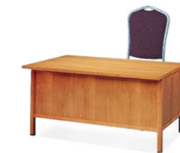
Teacher Table & Chairs 1 set