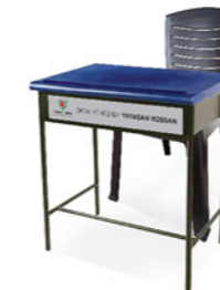
Student Table and Chair 500mm (W) x 700mm (D) x 750mm (H)