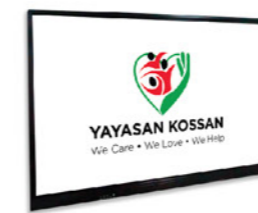
Eco Net Multi Touch Screen 1 set

All pictures shown are for illustration purpose only and may differ from actual product.