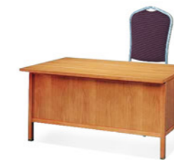
Teacher Table and Chair 1200mm (W) x 700mm (D) x 750mm (H)