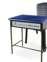
Student Table & Chairs 50 sets